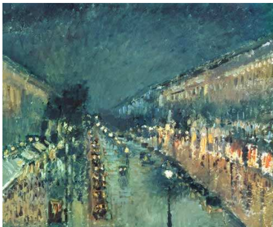
C. Pissarro, Le boulevard Montmartre, di notte, 1897

A pagina 12 sono indicati alcuni siti in cui è possibile vedere ed ascoltare un'intervista a Carl Gustav Jung.